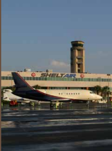
FBO Facilities & Office Space