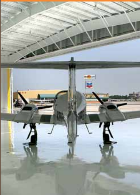
Daytona Beach (DAB)