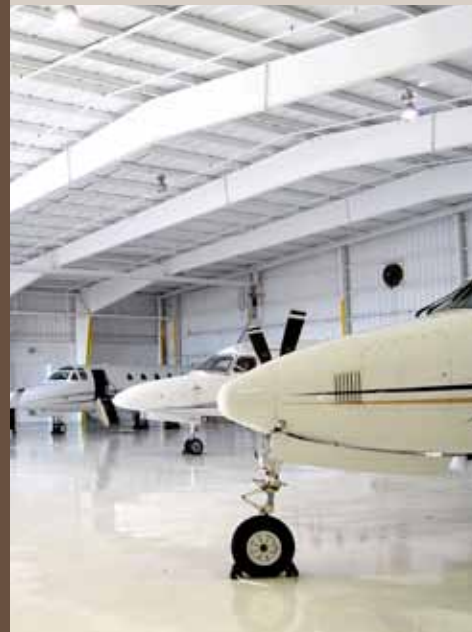
St. Petersburg-Clearwater (PIE)

See a full listing of each location's individual features and amenities by visiting us on the web at SheltAirAviation.com/facilities