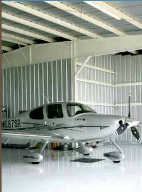
Orlando Executive (ORL)