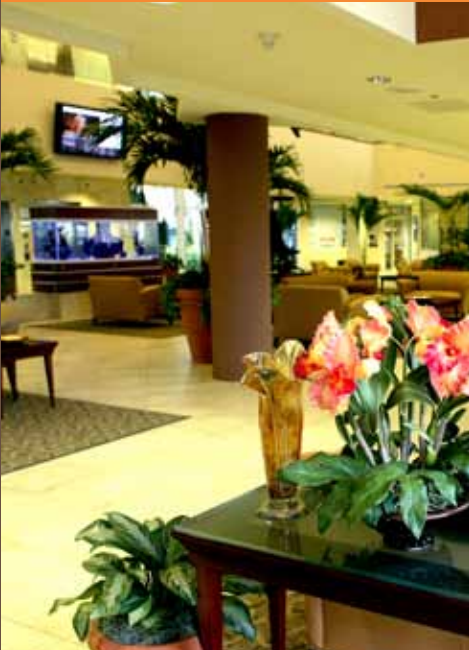
Ft. Lauderdale (FLL)