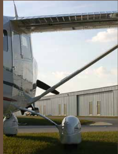
General Aviation Facilities