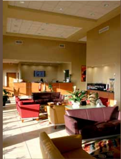
Daytona Beach (DAB)

Discover our full range of design and construction capabilities by visiting us on the web at SheltAirAviation.com/holland