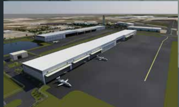
Coming Soon! FLL West Side Hangar Complex